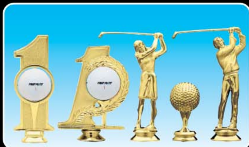
T221 HOLE IN ONE (100-O-5¾")