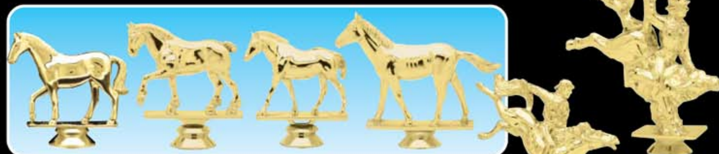
F510 HORSE (100-N-3 3/4") F4140 DRAFT HORSE (100-O-3 3/4") F4150 QUARTER HORSE (50-U-3 3/4") F1740 ARABIAN HORSE (50-N-4 1/4")