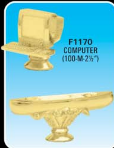
F1170 COMPUTER (100-M-2 1/2")