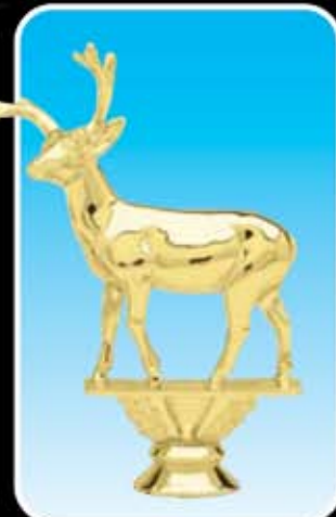
F1360 BUCK DEER (50-T-5 1/2")