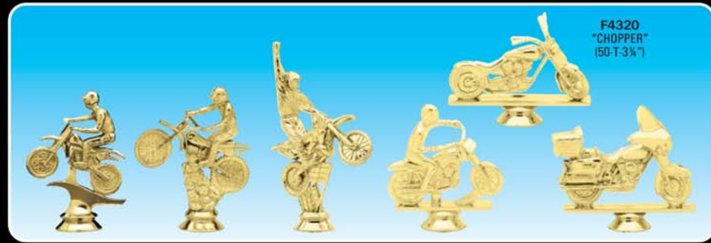
F312 MOTORCYCLE, M (100-N-4 1/4") F1922 DIRT BIKE, M (50-N-4 1/4") F3422 w/ HAND RAISED (100-O-6") F4320 "CHOPPER" (50-T-3 1/4") F4352 FLAT TRACK (50-O-4") F4310 TOURING (50-T-4")