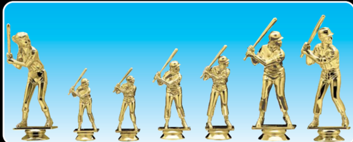
F651 PONYTAIL, F (100-K-5")