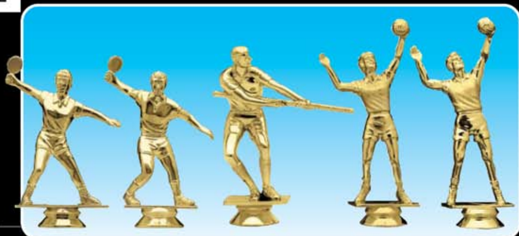
F501 TABLE TENNIS, F (100-0-4 1/4")