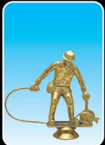
F772 FISHERMAN (100-N-4")