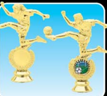
F4701 1" HOLDER, F (100-P-5")