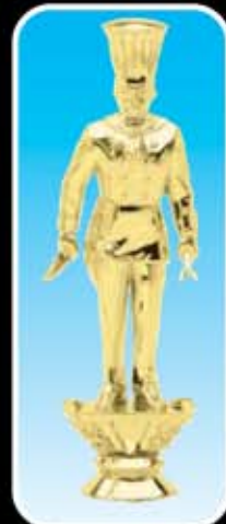
F1282 CHEF (50-U-7")