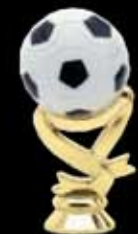
F3640 PAINTED SOCCER TRIM (100-K-2½")