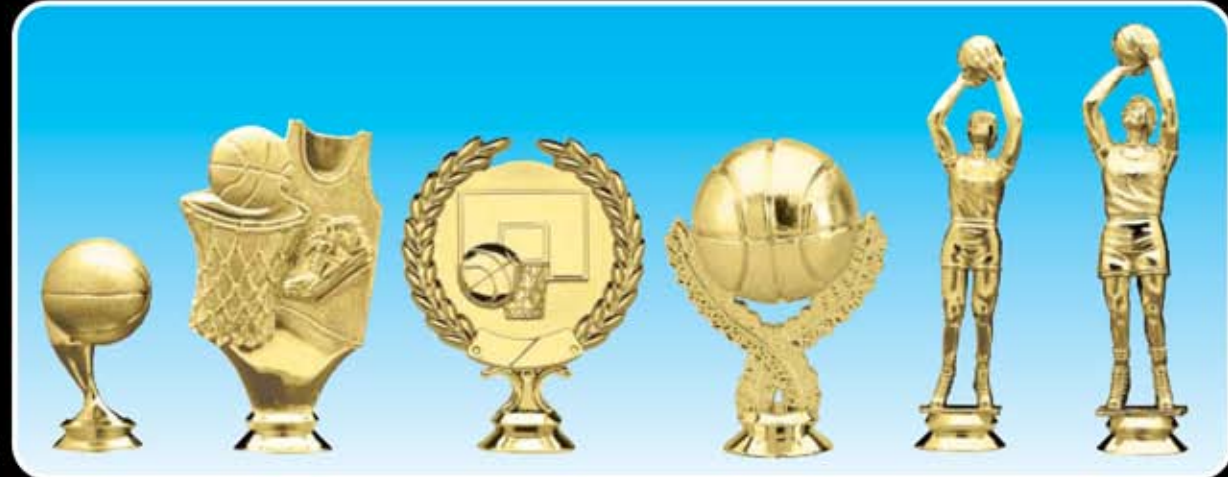
F280 BASKETBALL TRIM (100-K-2 1/2") T141 BASKETBALL (100-O-4 1/2") WH103 BASKETBALL (100-O-4 1/2") F800 BASKETBALL (50-T-5") F281 BASKETBALL, F (100-M-6 1/4") F282 BASKETBALL, M (100-M-6 1/4")