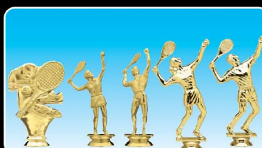
T151 TENNIS (100-O-4 1/2") F121 TENNIS, F (100-J-5") F122 TENNIS, M (100-J-5") F123 TENNIS, F (100-N-6 1/2") F124 TENNIS, M (100-N-6 1/2")