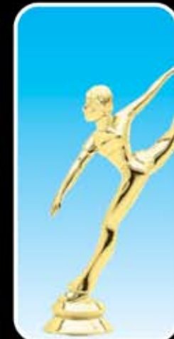
F2411 MODERN DANCE, F (100-0-5 1/2")