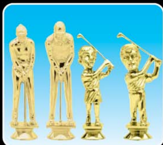
F4051 PUTTER, F (100-L-5¼")