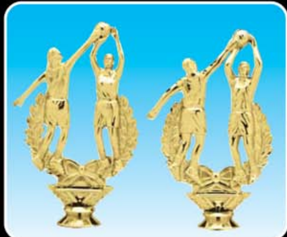
F805 BASKETBALL DBL. ACT., F (100-O-6 1/4") F806 BASKETBALL DBL. ACT., M (100-O-6 1/4")