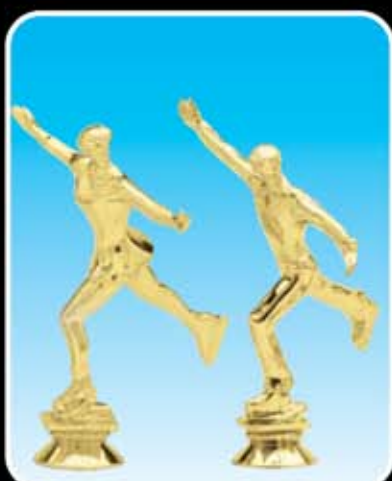
F1501 ICE SKATER, F (50-P-5 1/2") F1502 ICE SKATER, M (50-P-5 1/2")