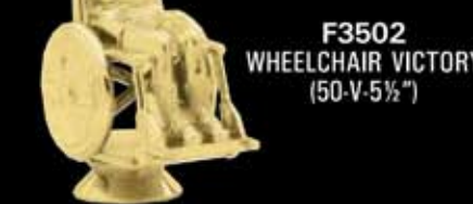
F3502 WHEELCHAIR VICTORY (50-V-5 1/2")