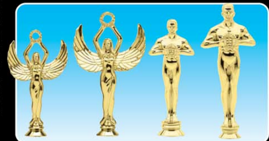
F1161A VIC. w/ WREATH, F (100-K-5 1/2")