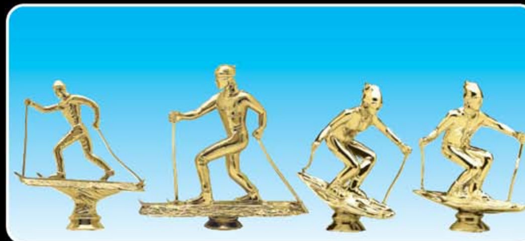
F632 X-COUNTRY SKI, M (100-O-5") F612 X-COUNTRY SKI, M (50-S-5 1/2") F1011 SNOW SKIER, F (50-P-4 1/2") F1012 SNOW SKIER, M (50-P-4 1/2")