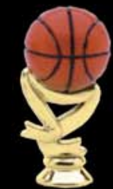
F3650 PAINTED BASKETBALL TRIM (100-K-2 1/2")