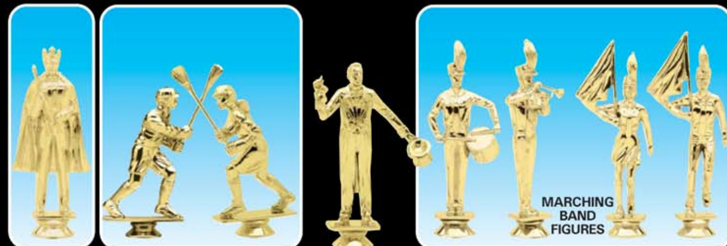
F4044 KING (100-O-6 1/4") F972 LACROSSE, M (100-P-5 1/2") F971 LACROSSE, F (100-P-5 1/2") F4422 MAGICIAN, M (100-6") F3612 DRUMMER, M (100-O-6 1/2") F3622 BUGLER, M (100-O-6 1/2") F3631 COLOR GUARD, F (100-O-6 1/2") F3632 COLOR GUARD, M (100-O-6 1/2")