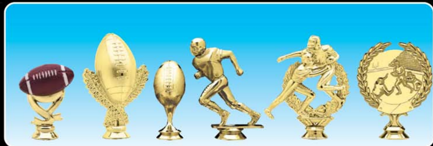
F3670 FOOTBALL TRIM (100-K-2½")