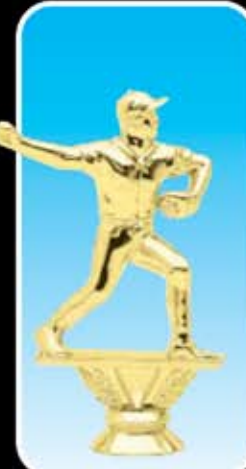
F1532 BASEBALL PITCHER, M (50-M-5")