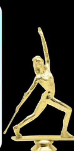
F4431 BATON TWIRLER (100-6")