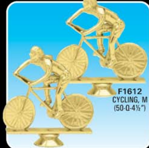
F1611 CYCLING, F (50-Q-4 1/2")