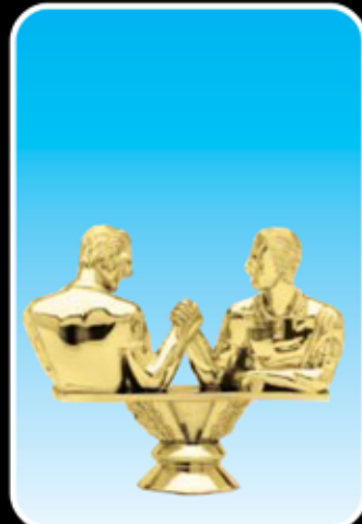
F1490 ARM WRESTLING (50-U-3 1/2")