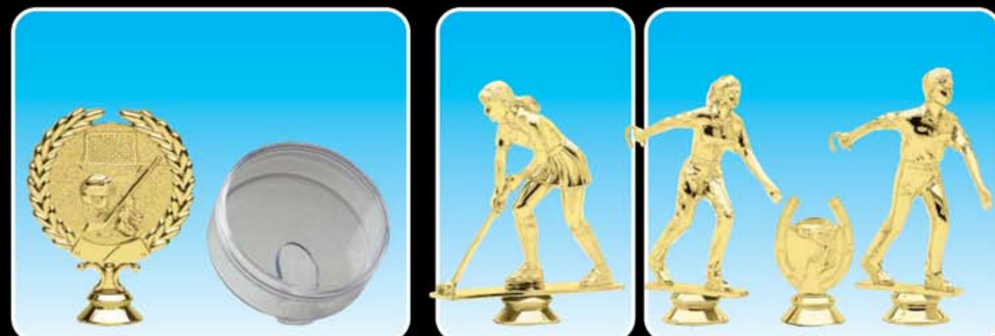
WH110 HOCKEY (100-O-4¼")