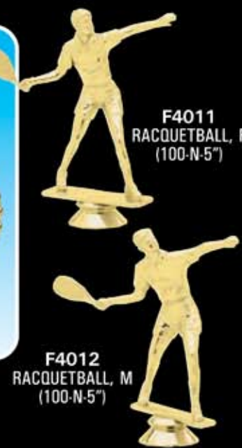
F4011 RACQUETBALL, F (100-N-5")