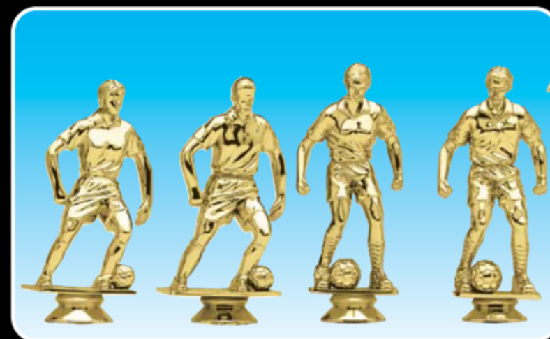
F1081 SOCCER FORWARD, F (100-L-5")