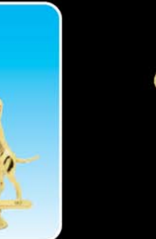
F4120 COON IN TREE (50-P-5")