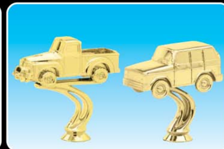
F3040 PICKUP TRUCK (50-U-4 3/4")