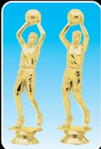
F4261 JUMP SHOT, F (100-L-6") F4262 JUMP SHOT, M (100-L-6")