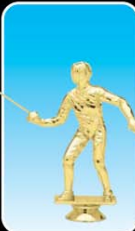
F2022 FENCING, M (100-N-5 1/2")