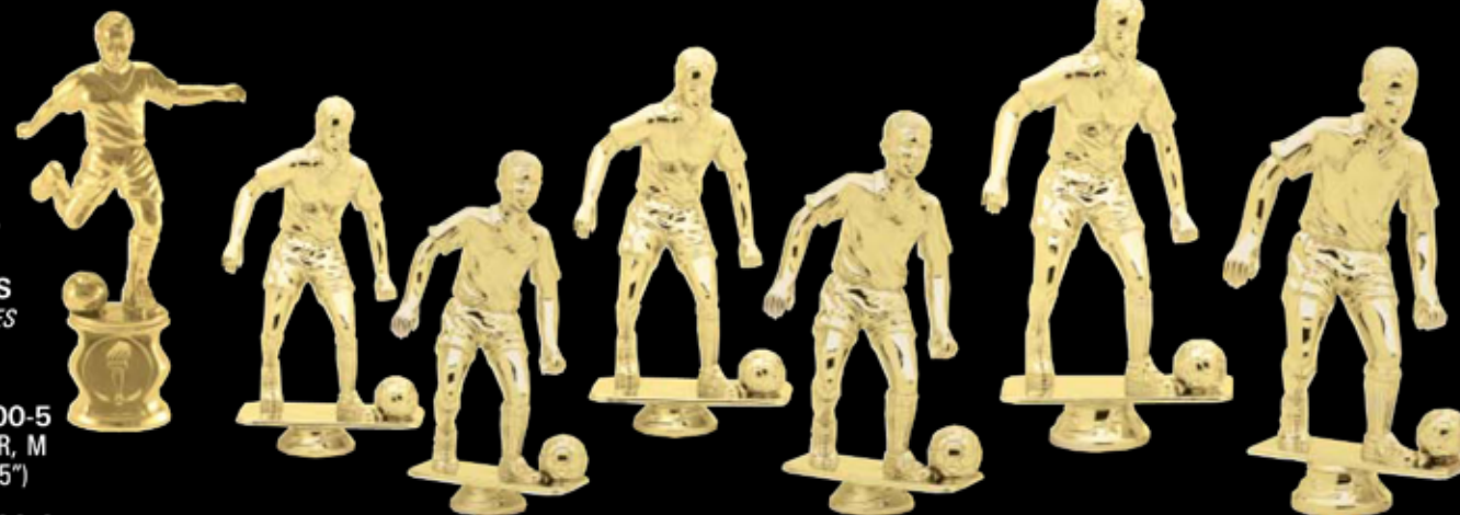
RP8200-5 SOCCER, M (100-5")