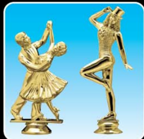
F520 DANCING COUPLE (100-S-5 1/4") F711 TAP DANCER, F (100-Q-6")