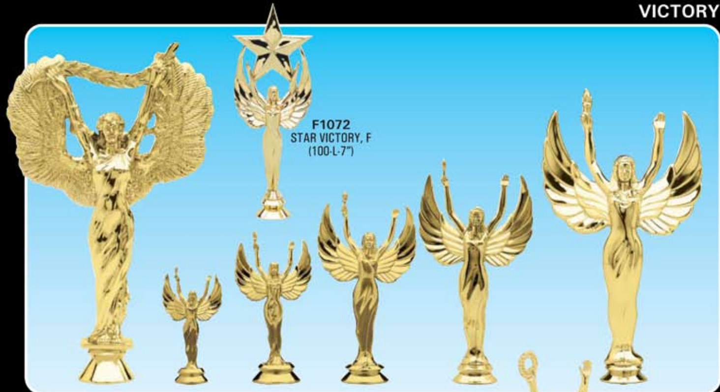
F1072 STAR VICTORY, F (100-L-7")