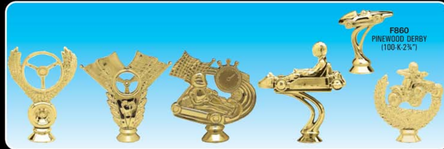
F1120 WINGED WHEEL (100-N-4 3/4")