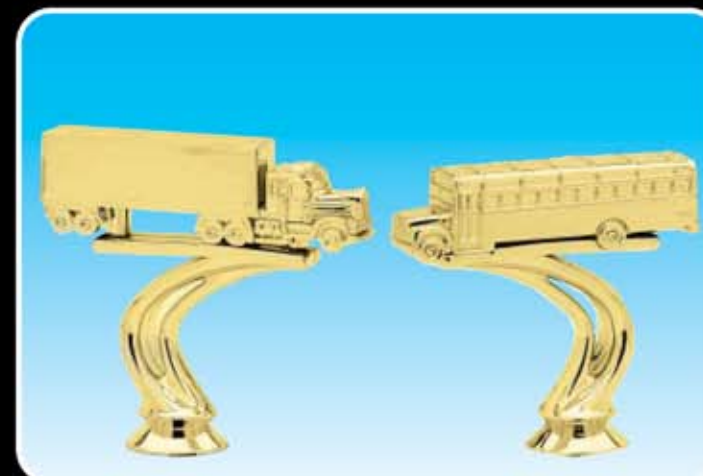
F1210 TRACTOR TRAILER (50-T-4 3/4")