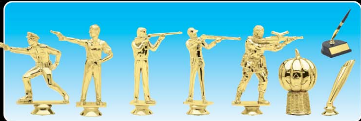
F2332 POLICE PISTOL, M (50-Q-4 1/4") F2032 PISTOL SHOOTING, M (100-N-5 1/2") F1692 CIVILIAN RIFLE, M (50-P-5") F2352 TRAP SHOOTER, M (50-O-5") F1992 PAINTBALL, M (50-V-5 1/2") F1290 PUMPKIN (50-U-3 1/2") PH101 PEN FUNNEL (100-H-2 1/2")