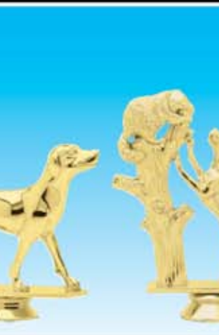
F2160 FOX HOUND (100-O-4")