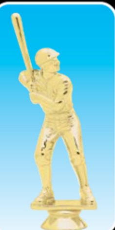
F369 BASEBALL, M (100-K-5 1/4")