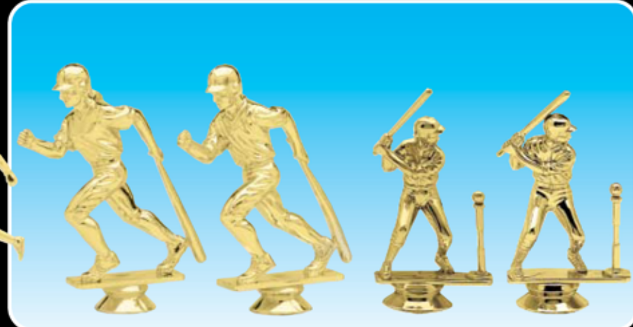
F2061 BAT DOWN, F (100-K-5 1/2")