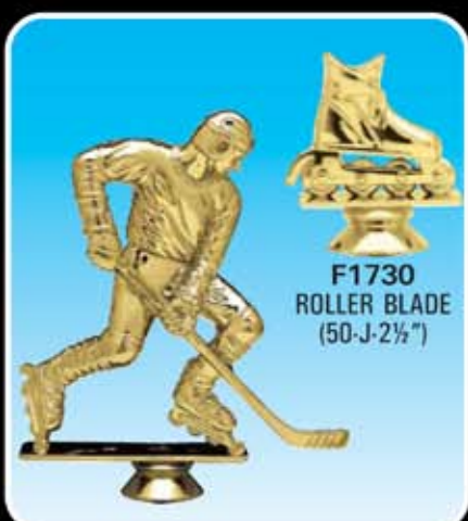
F1730 ROLLER BLADE (50-J-2 1/2")