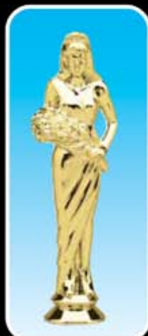
F841 BEAUTY QUEEN (100-P-6")