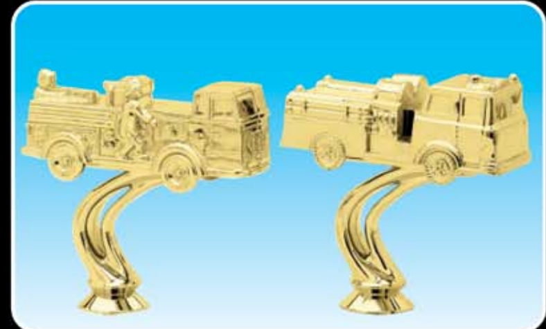
F1230 FIRE ENGINE (50-S-4 1/2")