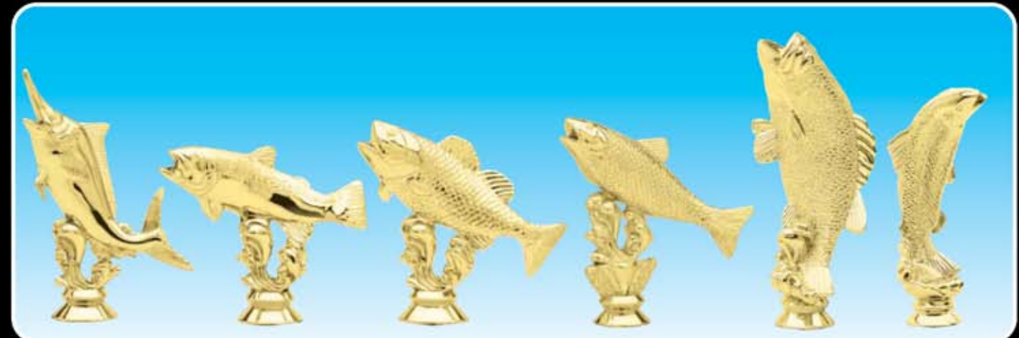
F1710 MARLIN (50-O-4 1/2")