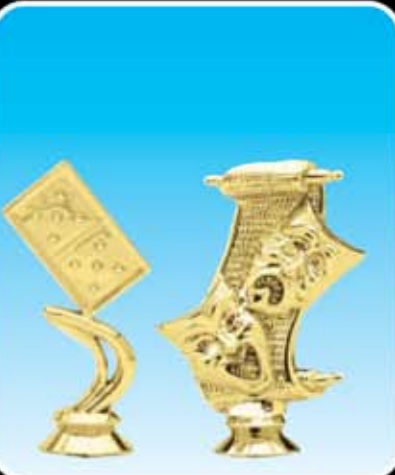
F1350 DOMINO (50-O-4 1/2")