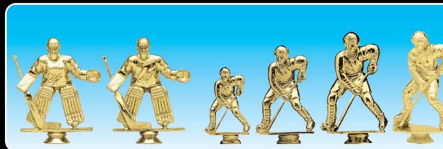
F1571 GOALIE, F (50-P-5")