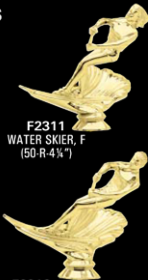
F2311 WATER SKIER, F (50-R-4 1/4")