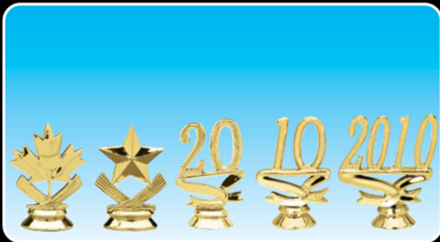
F1100 MAPLE LEAF (100-E-2 1/4")