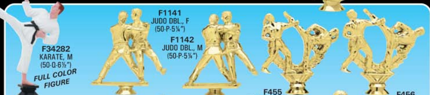
F34282 KARATE, M (50-O-6 1/2") FULL COLOR FIGURE F1141 JUDO DBL., F (50-P-5 1/4") F1142 JUDO DBL., M (50-P-5 1/4") F455 KARATE DBL., F (50-O-5") F456 KARATE DBL., M (50-O-5")