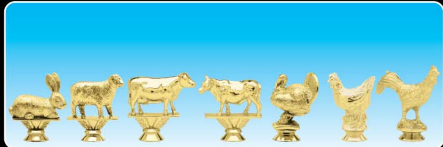
F1410 RABBIT (50-T-3 1/2")