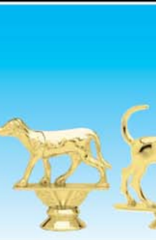
F1680 GREYHOUND (50-N-3 1/4")