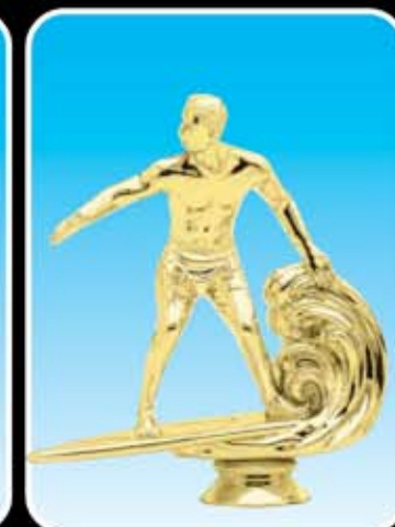
F2362 SURFER, M (50-P-6")