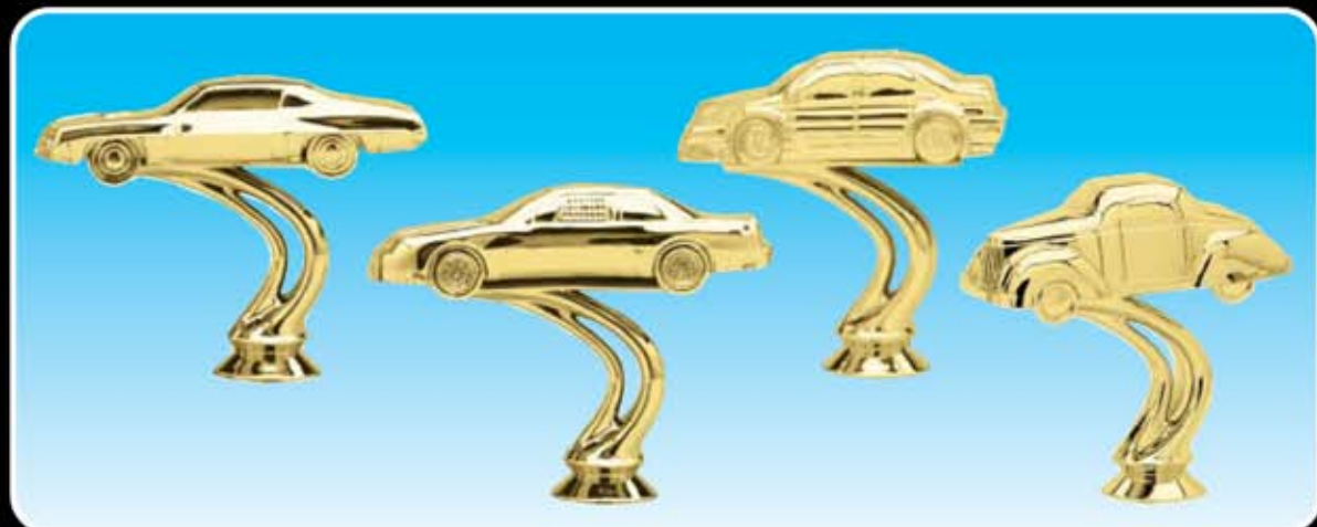
F900 STOCK CAR (50-S-3 3/4")