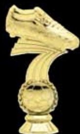
T371 SOCCER SHOE TRIM (100-4")