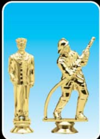
F1220 DRESS FIREMAN (50-P-5")