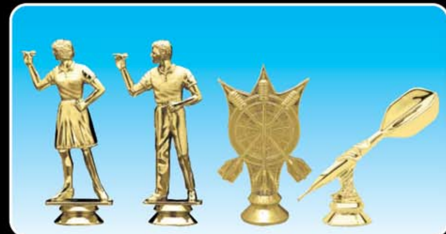
F371 DARTS, F (100-M-5 1/4") F372 DARTS, M (100-M-5 1/4") T251 DART THEME (100-0-4 1/2") F1650 DART SINGLE (50-N-3 1/4")