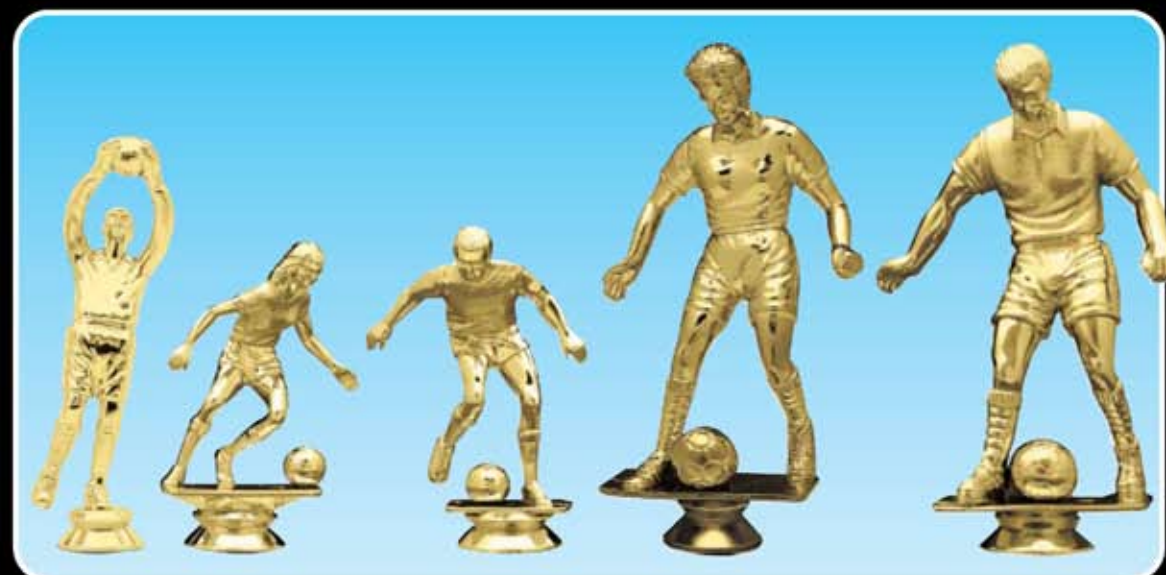
F812 SOCCER GOALIE, M (100-N-6")