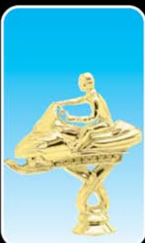
F3020 SNOWMOBILE, M (100-V-4 1/4")