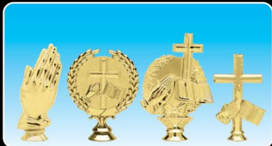
F4210 PRAYING HANDS (50-N-4") WH131 CROSS (100-0-4 1/2") F870 WREATH RELIGIOUS (100-0-5 1/2") F1330 CROSS, BIBLE & HANDS (50-M-4 1/2")