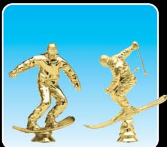
F1022 SNOW BOARD, M (100-P-5 1/2") F1852 DOWN HILL SKIER, M (50-O-4 1/2")