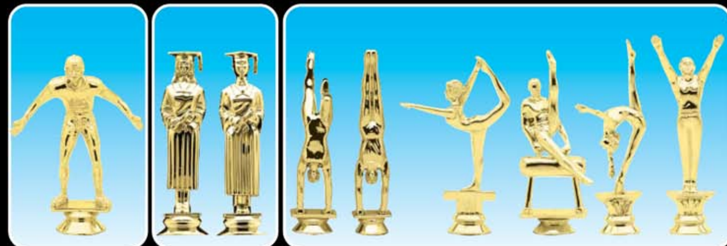
F4062 FOOTBALL LINEMAN (100-K-5¾")