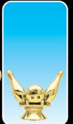
F790 BALL & PIN TRIM (50-J-2 1/2")