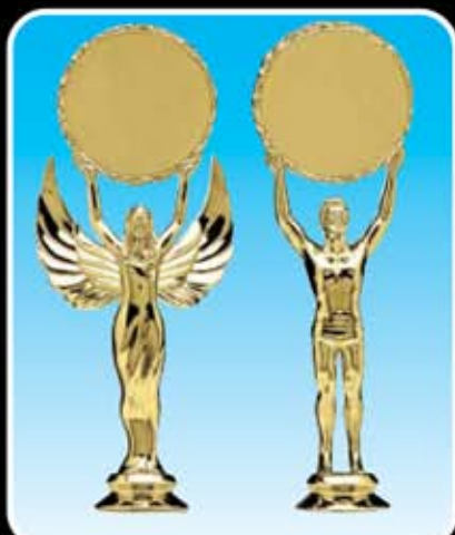
F671 VIC. 2" HOLDER, F (100-L-6 1/2")