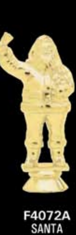
F4072A SANTA (100-P-4 1/2")