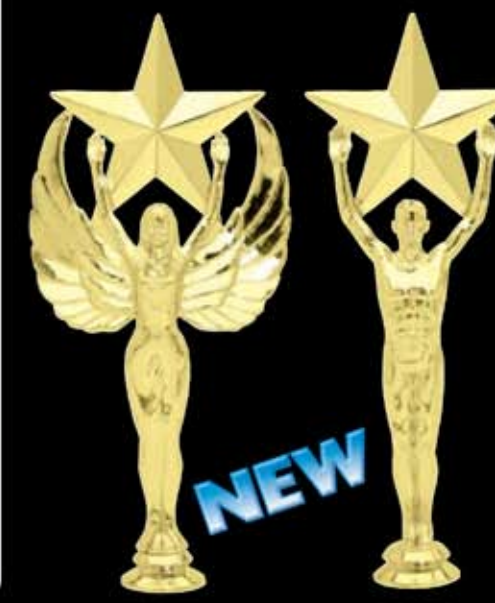
F1075 STAR VICTORY, F (25-10")