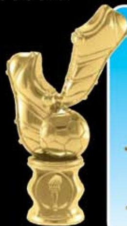
RP8290 SOCCER, SHOES (100-6") ACCOMMODATES 1" MYLAR