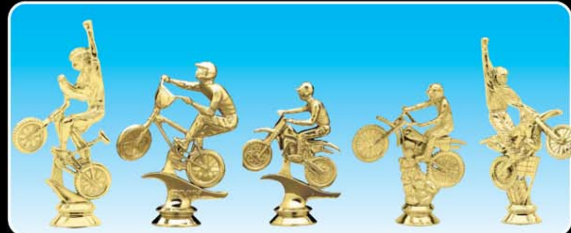
F2010 BMX, BIKE WINNER (100-O-5 1/4") F302 BMX, M (100-N-4 1/4") F312 MOTORCYCLE, M (100-N-4 1/4") F1922 DIRT BIKE SCRAMBLER, M (50-N-4 1/4") F3422 w/ HAND RAISED (100-O-6")