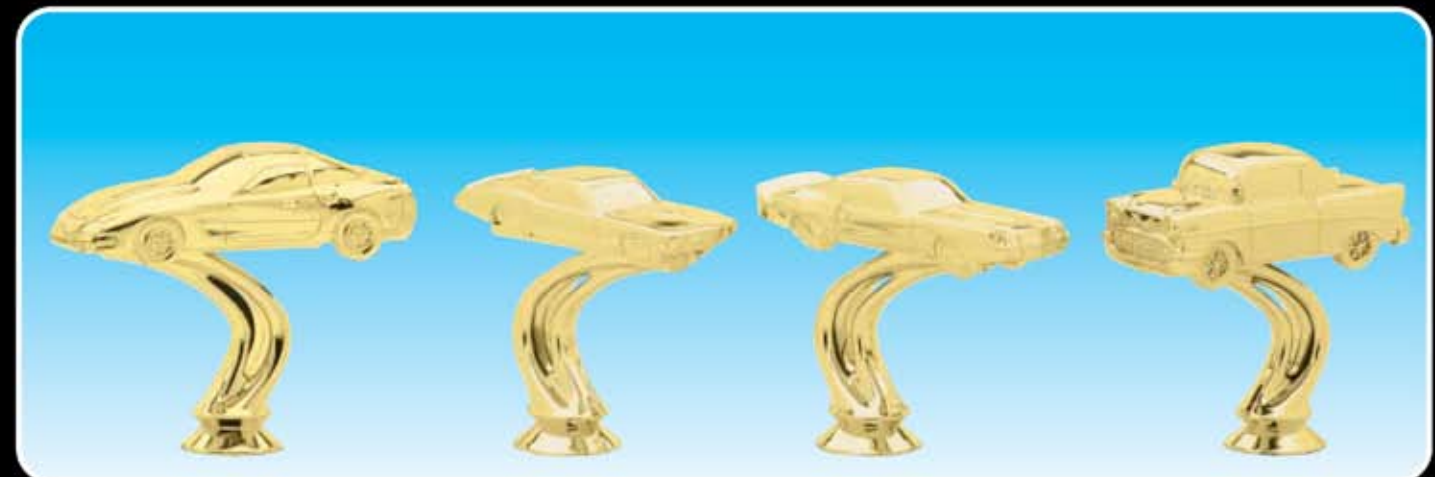
F2030 CORVETTE (50-V-4")