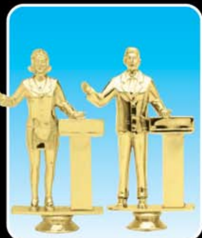
F1841 PUBLIC SPEAK, F (50-O-5 1/2") F1842 PUBLIC SPEAK, M (50-O-5 1/2")