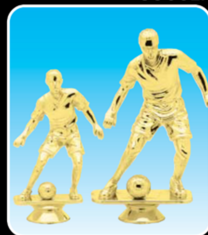
F1135 SOCCER, M (100-L-5")