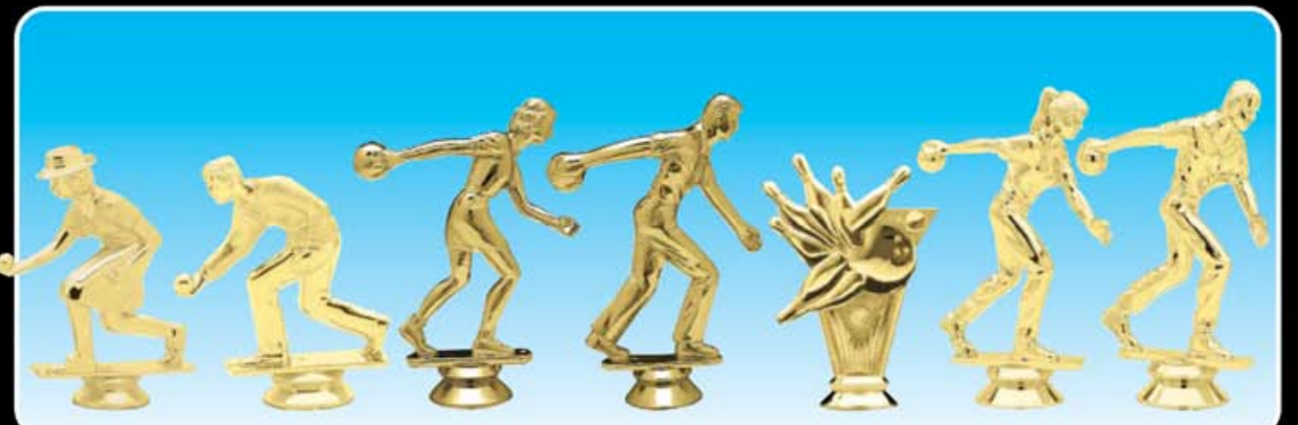
F381 LAWN BOWLER, F (100-N-4") F382 LAWN BOWLER, M (100-N-4") F791 BOWLING, F (100-K-5 1/2") F792 BOWLING, M (100-K-5 1/2") T121 BOWLING (100-O-4 1/2") F3531 DUCK PIN, F (100-L-5 1/2") F3532 DUCK PIN, M (100-L-5 1/2")