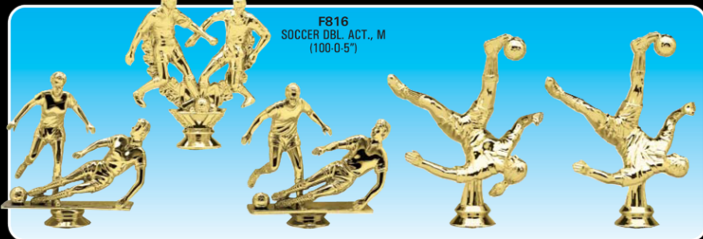
F816 SOCCER DBL. ACT., M (100-O-5")