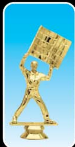
F1912 FLAGMAN (50-K-5")