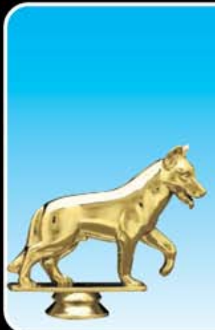
F560 ALSATIAN DOG (100-O-3 3/4")