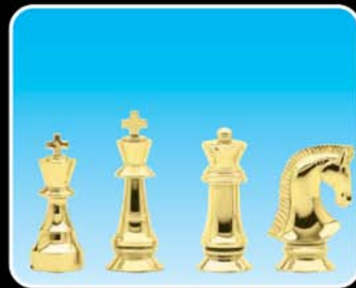
F1320 CHESS KING (50-P-3") F2240 KING (100-N-3 1/4") F2250 QUEEN (50-N-3 1/4") F2260 KNIGHT (50-N-2 1/4")