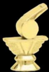
F1950 WHISTLE (50-K-2 1/2")