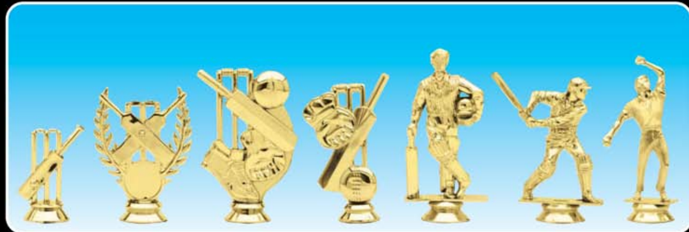
F290 WICKET TRIM (100-J-2 1/4") H171 CRICKET - 1" HOLDER (100-H-3 1/4") T191 CRICKET - 1" HOLDER (100-0-4 1/2") T211 CRICKET THEME (100-0-4 1/2") F1932 CRICKET BATSMAN (50-N-5") F202 CRICKET BATSMAN (100-M-4 1/2") F222 CRICKET BOWLER (100-N-4 1/4")