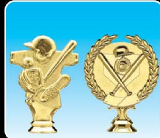
T131 BASEBALL (100-O-4 1/4")