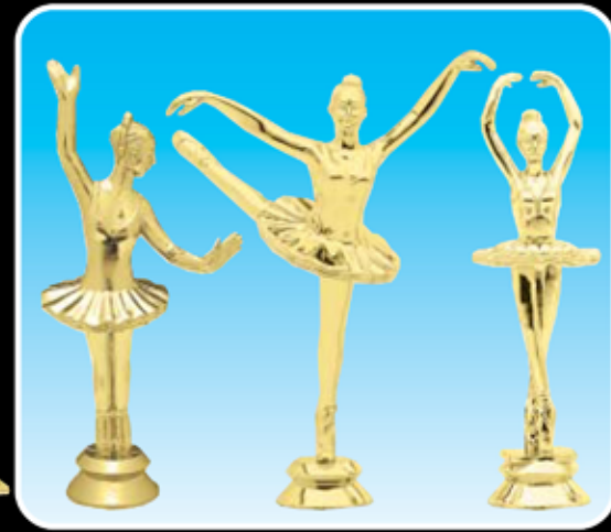
F741 BALLERINA (100-O-5 1/2")