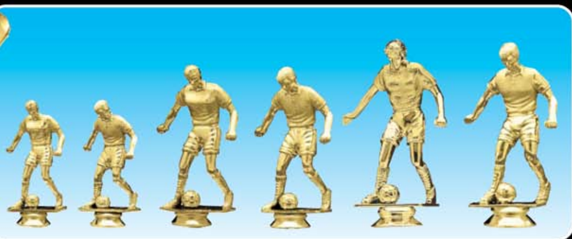
F401AA SOCCER, F (100-H-3")