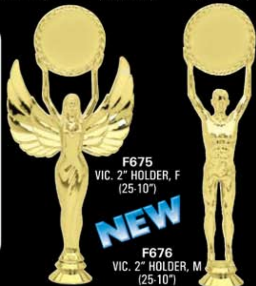
F675 VIC. 2" HOLDER, F (25-10")