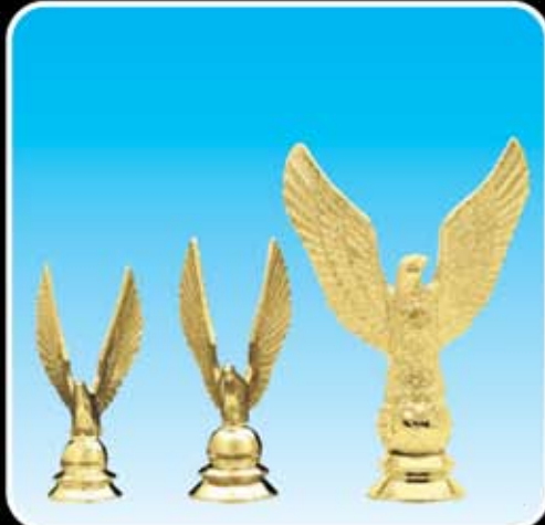
F240A EAGLE, SMALL (100-D-2 1/2")