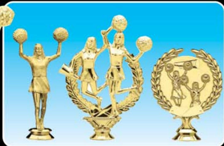
F321 CHEERLEADER, F (100-L-5 1/4") F325 CHEERLEADER DBL. ACT. (50-0-6 1/2") WH105 CHEERLEADING (100-0-4 1/2")