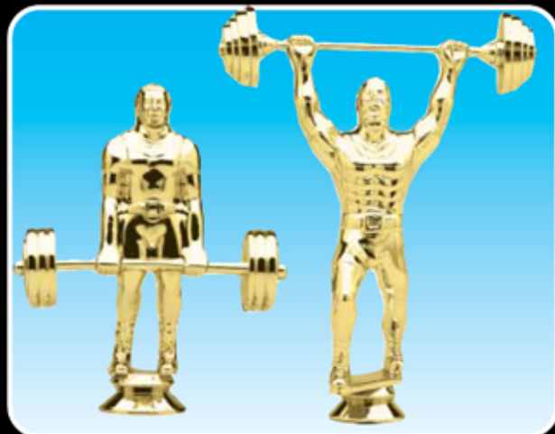
F1032 POWERLIFTER, M (100-R-5")