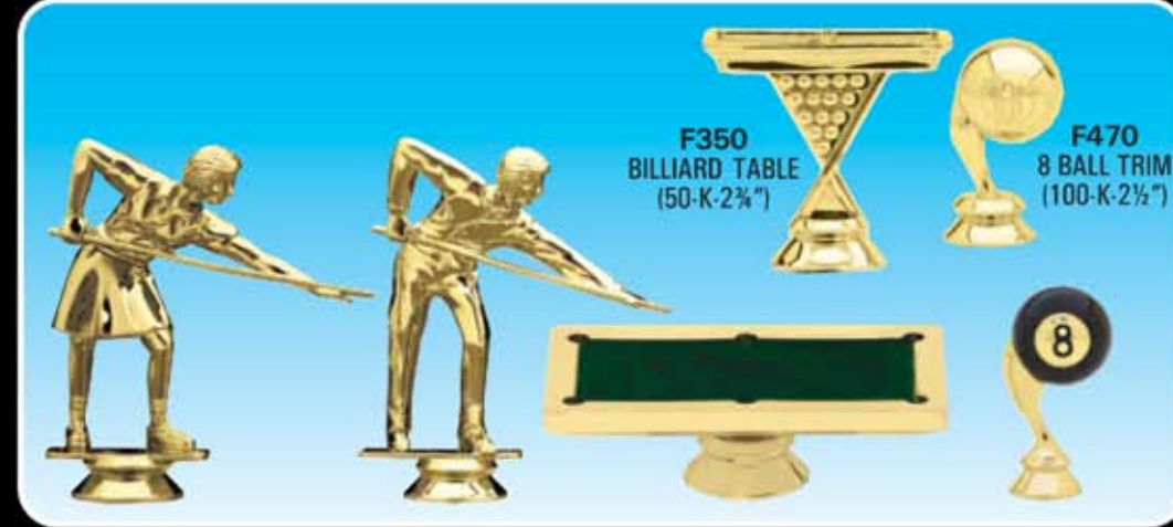
F471 BILLIARDS, F (100-N-4 1/2") F472 BILLIARDS, M (100-N-4 1/2") F4090 BILLIARD TABLE w/ GREEN FELT (100-R-2 1/4" x 4 1/4") F4110 8 BALL TRIM (100-K-2 1/2")