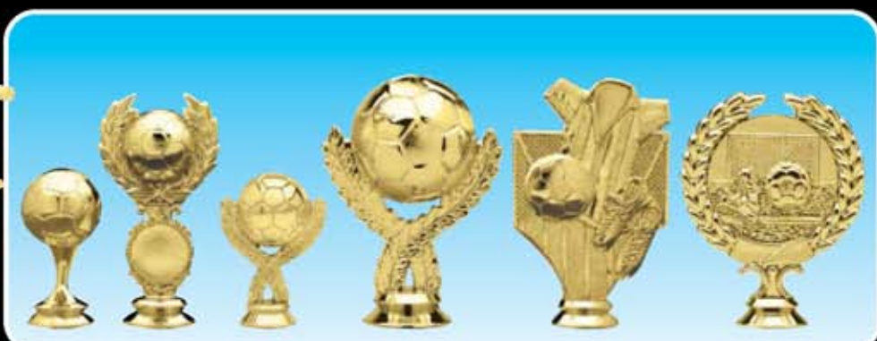
F270 BALL TRIM (100-K-2½")