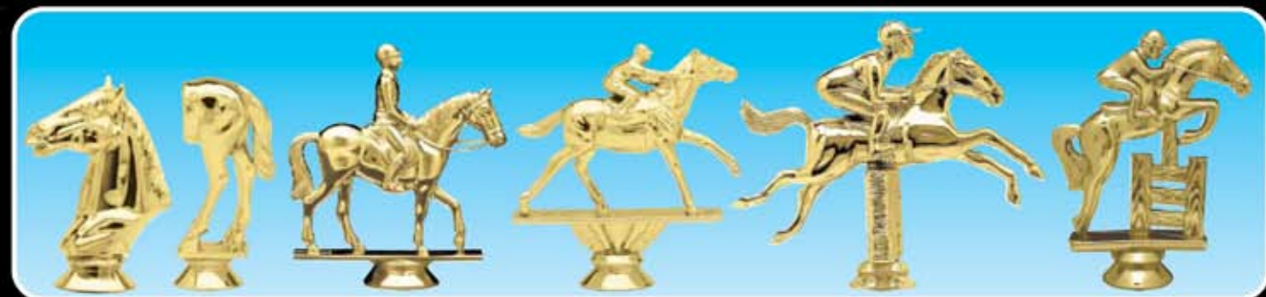
F1760 HORSE HEAD (50-L-3 3/4") F1750 HORSE'S REAR (50-N-3 3/4") F442 EQUESTRIAN (100-O-4 1/4") F1812 HORSE RACING (50-N-4 1/4") F592 JUMPING HORSE (50-S-5") F782 JUMPING HORSE (100-R-4 1/4")