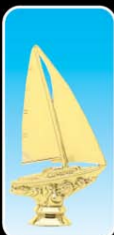
F3010 SAILBOAT (100-S-5")