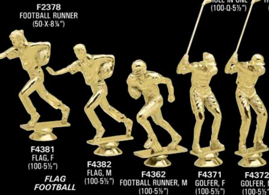
F4381 FLAG, F (100-5¾")