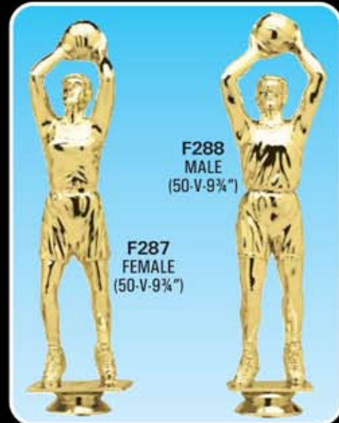
F287 FEMALE (50-V-9 1/4") F288 MALE (50-V-9 1/4")