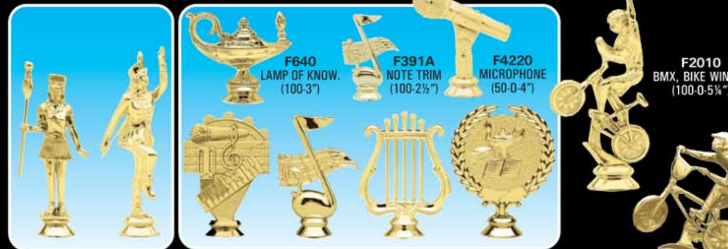
F1821 MAJORETTE (50-O-5 1/2") F2292 MAJORETTE (50-N-6") F390 MUSIC / INSTR. (100-O-4 1/4") F391 MUSIC NOTE (100-O-4 1/4") F392 MUSIC LYRE (100-O-4 1/4") WH112 LAMP OF KNOWLEDGE (100-O-4 1/2") F2010 BMX, BIKE WINNER (100-O-5 1/4") F302 BMX, M (100-N-4 1/4")