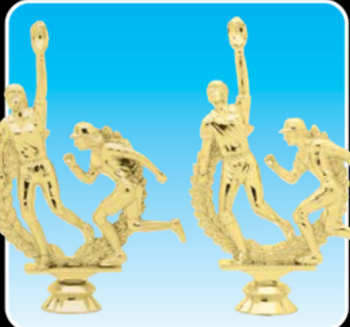
F4205 DOUBLE ACT., F (100-P-6 1/2")