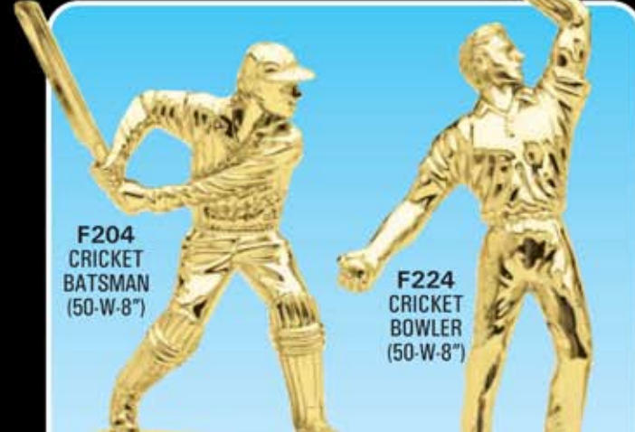
F204 CRICKET BATSMAN (50-W-8") F224 CRICKET BOWLER (50-W-8")