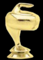
F620 CURLING STONE (100-K-2 1/4")