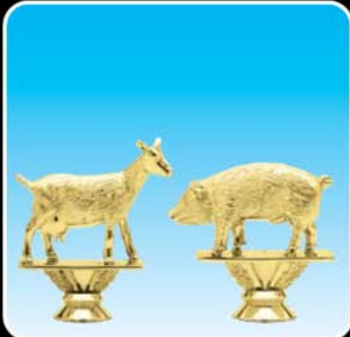
F1390 DAIRY GOAT (50-T-4")