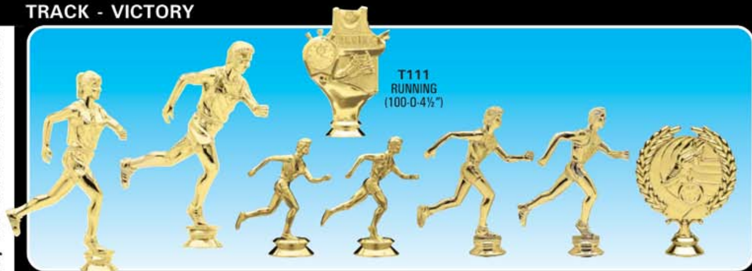
T111 RUNNING (100-0-4 1/2")