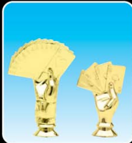
F1340 BRIDGE HAND (50-P-4 1/2") F1630 CRIBBAGE HAND (50-P-3 1/2")