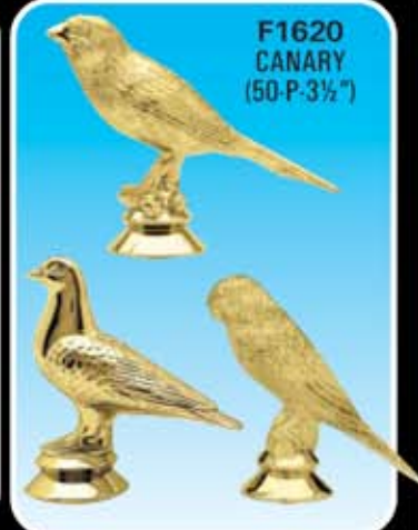
F490 PIGEON (100-S-3 1/4") F1960 BUDGERIGAR (50-N-3")