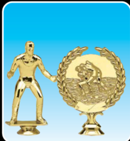
F932 WRESTLER (100-L-5 1/2")