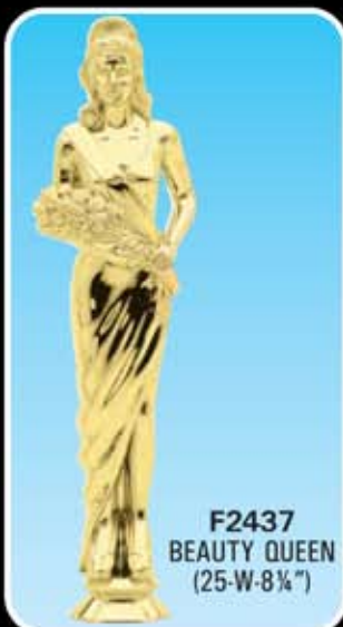
F2437 BEAUTY QUEEN (25-W-8 1/4")