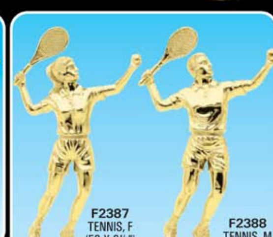
F2387 TENNIS, F (50-X-9 1/2")