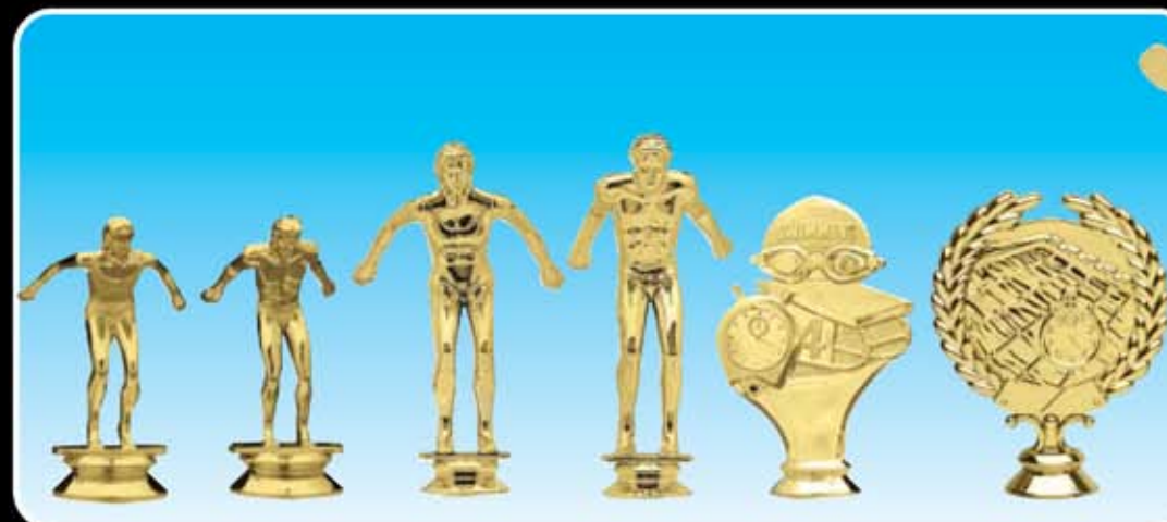
F151 SWIMMING, F (100-K-3 1/4") F152 SWIMMING, M (100-K-3 1/4") F153 SWIMMING, F (100-N-5 1/2") F154 SWIMMING, M (100-N-5 1/2") T101 SWIMMING (100-O-4 1/2") WH114 SWIMMING (100-O-4 1/2")