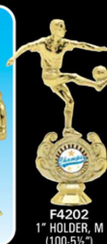
F4202 1" HOLDER, M (100-5½")