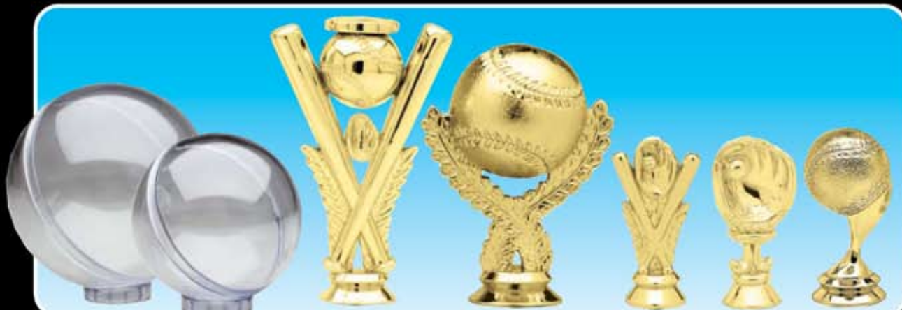
A006 SOFTBALL HOLDER (50-O)