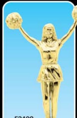
F3409 CHEERLEADER, F (50-W-10 1/2")