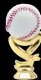
F3660 PAINTED BASEBALL TRIM (100-K-2 1/2")