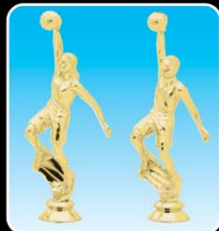
F4021 SLAM DUNK, F (100-N-6 1/2") F4022 SLAM DUNK, M (100-N-6 1/2")