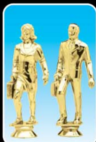
F1003 SALESMAN, F (100-N-6") F1004 SALESMAN, M (100-N-6")