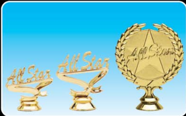
AS101 ALL STAR TRIM (100-D-1 3/4")