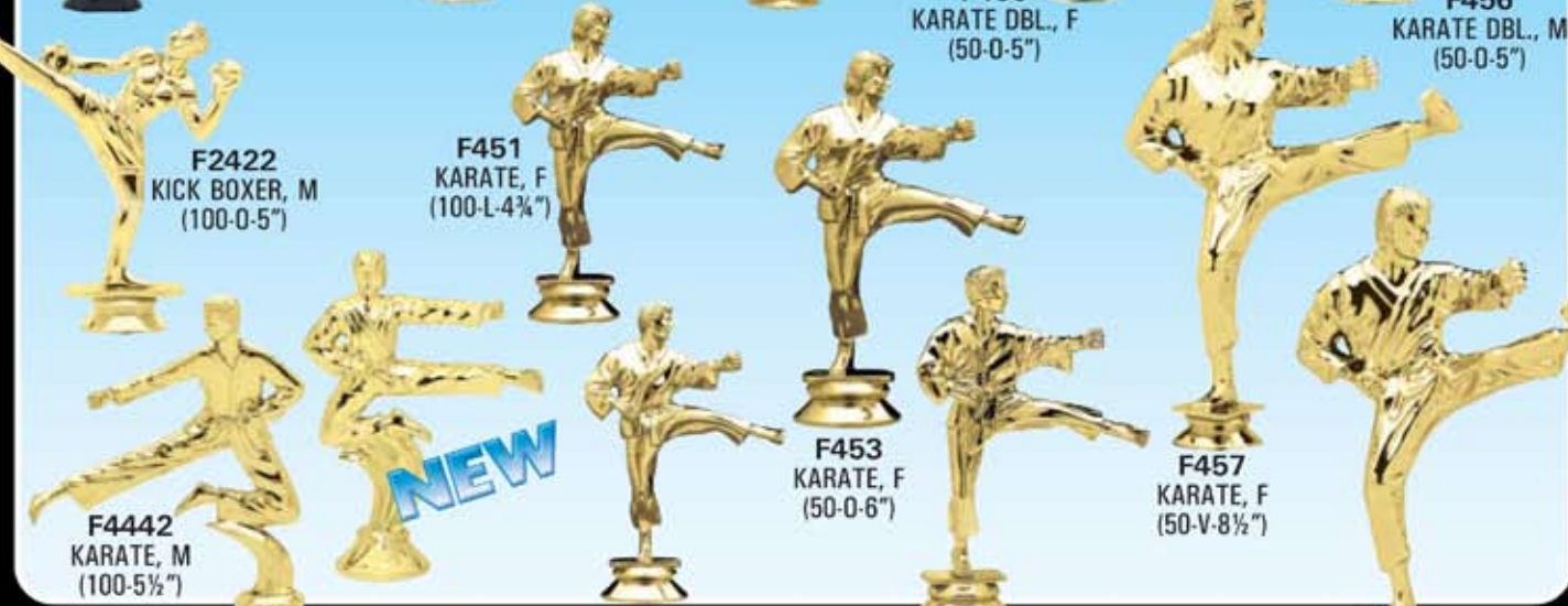
F2422 KICK BOXER, M (100-O-5") F451 KARATE, F (100-L-4 1/4") F4442 KARATE, M (100-5 1/2") F453 KARATE, F (50-O-6") F457 KARATE, F (50-V-8 1/4") F452 KARATE, M (100-L-4 1/4") F454 KARATE, M (50-O-6") F458 KARATE, M (50-V-8 1/4")