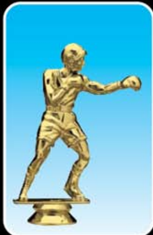
F462 BOXING (100-L-5")