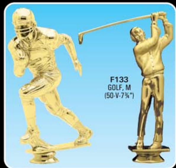
F133 GOLF, M (50-V-7¾")