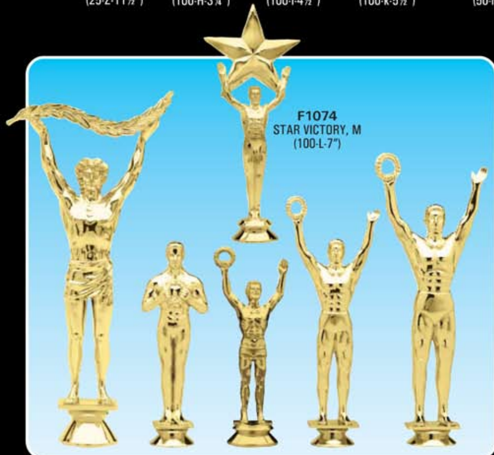
F1074 STAR VICTORY, M (100-L-7")