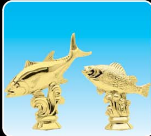
F2180 TUNA (50-N-4 1/4")