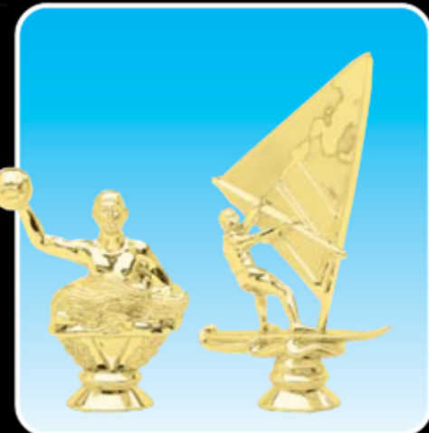
F1892 WATER POLO, M (50-S-3 3/4")