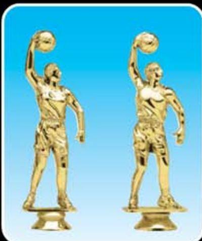
F801 HOOK SHOT, F (100-M-6") F802 HOOK SHOT, M (100-M-6")