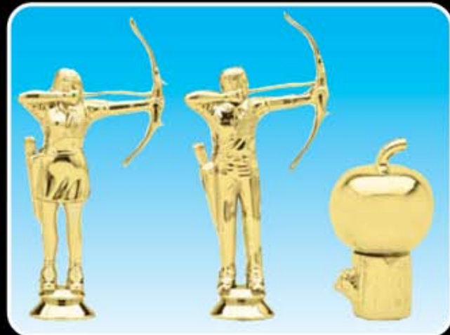
F991 ARCHERY, F (100-O-5")